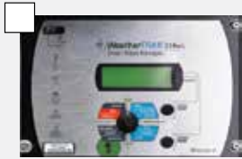
ET Pro 2 Smart Water Manager