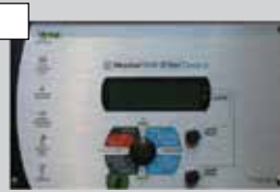
ET Pro 2 Central