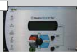
ET Pro 2