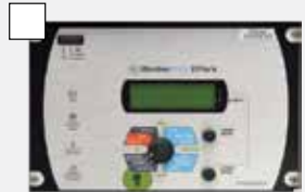
ET Pro 2 X